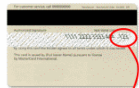
3 Digit Verification Number