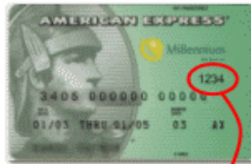
4 Digit Verification Number